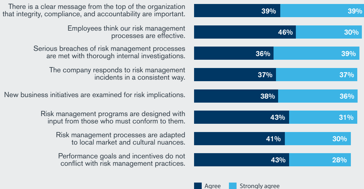
FIGURE 16 HOW DO ORGANIZATIONS PROMOTE A CULTURE OF INTEGRITY?

For most organizations, building a culture of integrity is an ongoing task, with each element at a different level of strength at any given time. Organizations can use a matrix to assess the state of their culture of integrity and prioritize areas requiring further work (see Figure 17).