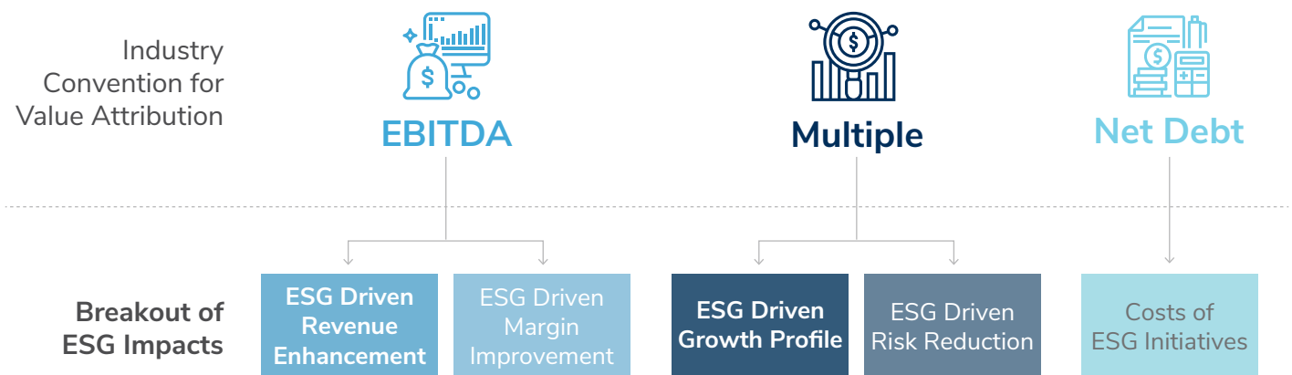
Figure 1: Building on the Value Bridge to Measure ESG Value Creation

As described earlier, the value drivers from an ESG initiative should fall into the categories depicted above, and if this can be measured the resulting impact on value is straightforward.